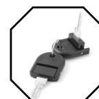
Keys x 2